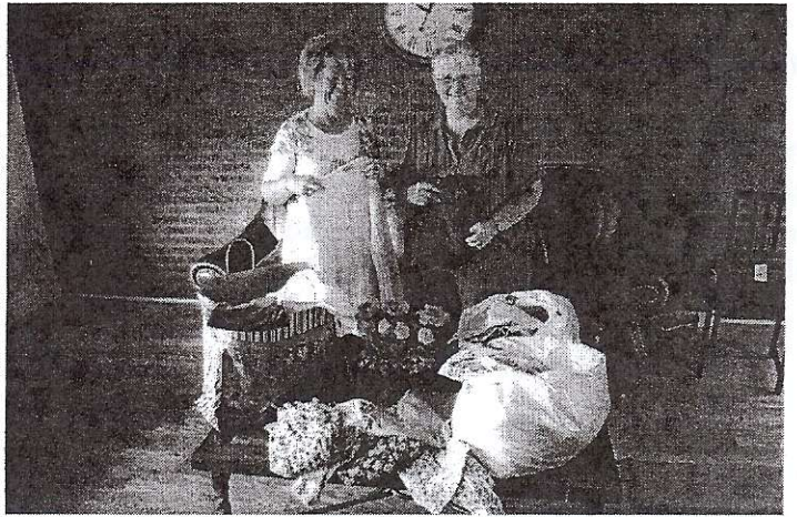
50 plus tops were donated to the Bear River Care Center