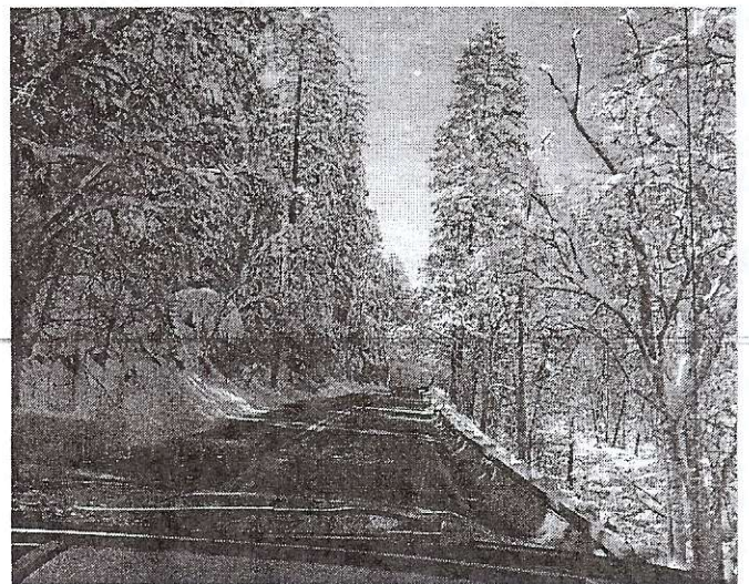
Beautiful Oak Creek Canyon, Sedona AZ.