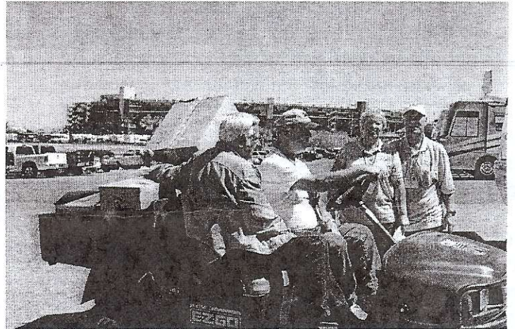
We had so many items for the Project Linus we had to have them come pick them up